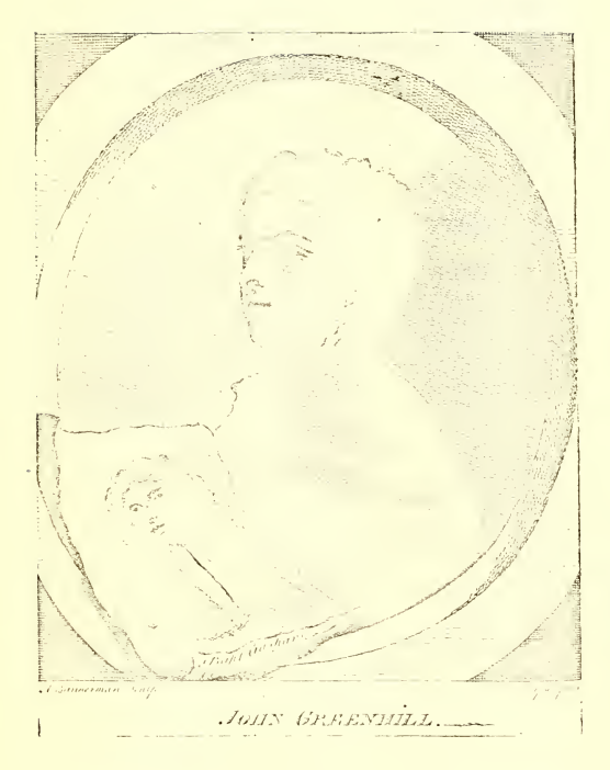
See "Willshire Notes and Quaries", Vol. v. p. 185.