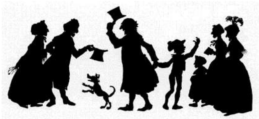
CHARLES DICKENS, A Christmas Carol

‘I have always thought of Christmas time, when it has come round - - apart from the veneration due to its sacred name and origin, if anything belonging to it can be apart from that -- as a good time: a kind, forgiving, charitable, pleasant time: the only time I know of, in the long calendar of the year, when men and women seem by one consent to open their shut-up hearts freely, and to think of people below them as if they really were fellow-passengers to the grave, and not another race of creatures bound on their journeys’.