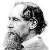
CHARLES DICKENS (1812-1870)

‘Happiness is a gift and the trick is not to expect it, but to delight in it when it comes’.