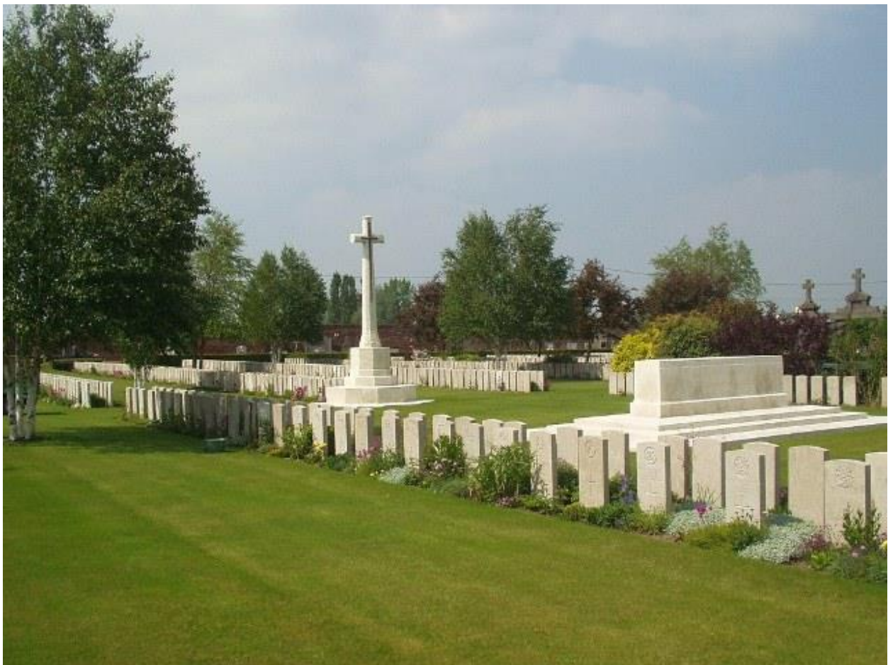
Bethune Town Cemetery, Pas de Calais, France

His Commonwealth War Grave headstone has the words "Love and Remembrance Liveth For Ever" carved into the stone.