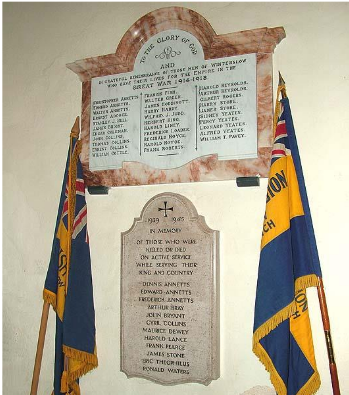
The Roll of Honour Plaque inside All Saints Church, Winterslow