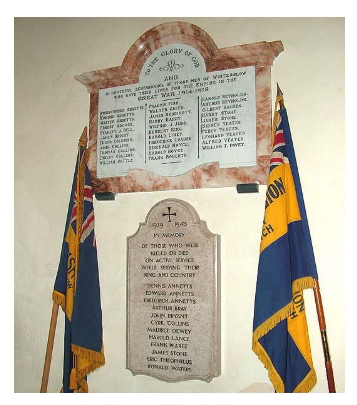
The Roll of Honour Plaque inside All Saints Church, Winterslow