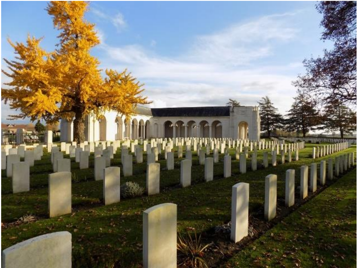
Le Touret Memorial, Pas De Calais, France