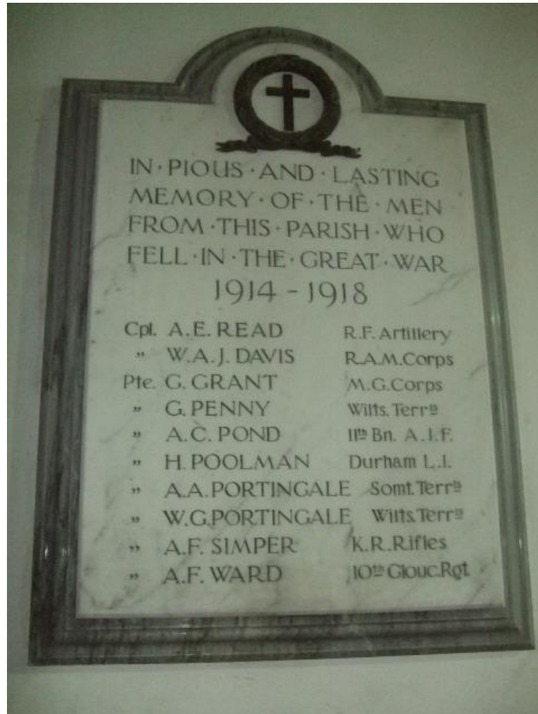
St. Mary's WWI Memorial Plaque