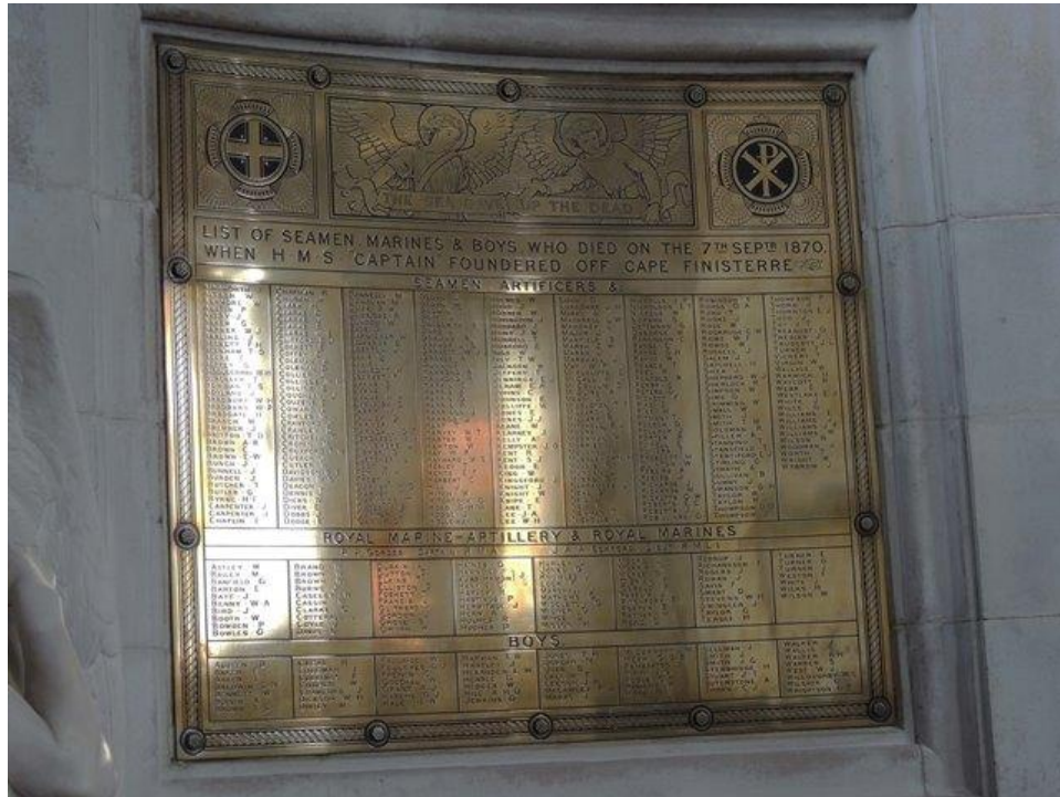
The second panel commemorating those who lost their lives

The Westminster Abbey memorial does not name as many of the victims but makes reference to the memorial in St. Paul's.