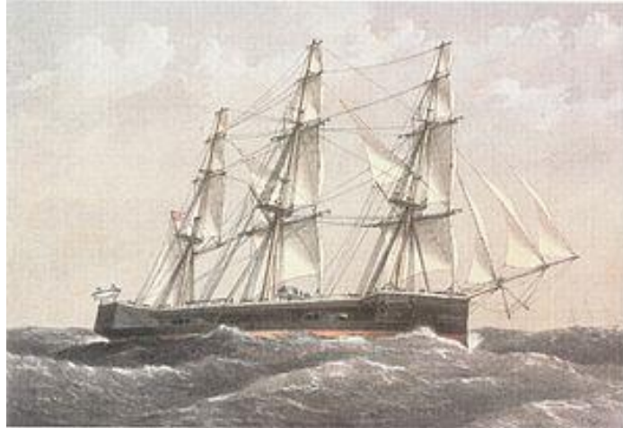
The Turret Ship "Captain"