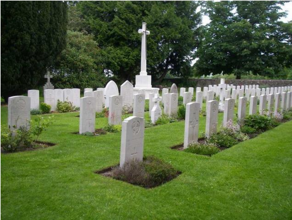
War Graves at Sutton Veny (Photos from CWGC)