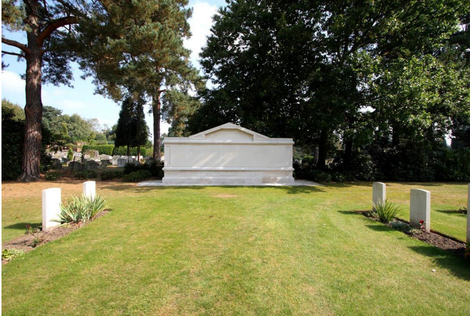
Brookwood (United Kingdom 1914-1918) Memorial