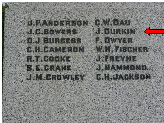
Kilmore War Memorial