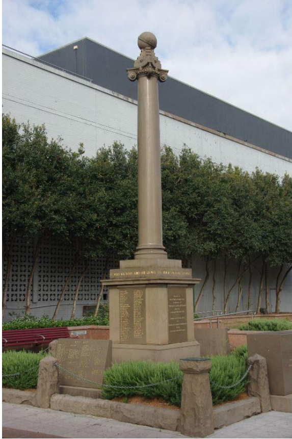
Hurstville War Memorial