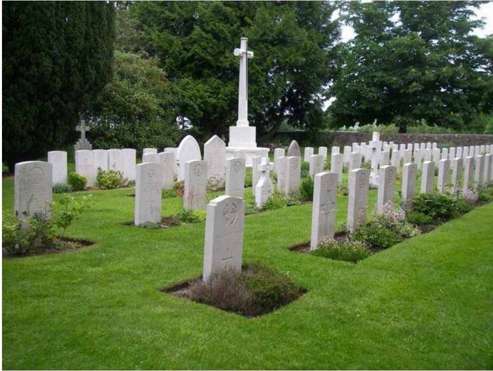
War Graves at Sutton Veny