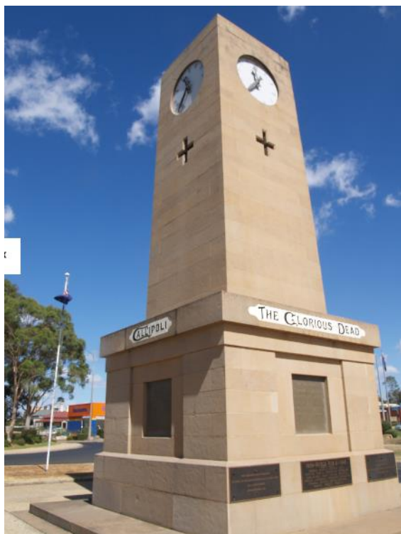
Corowa War Memorial