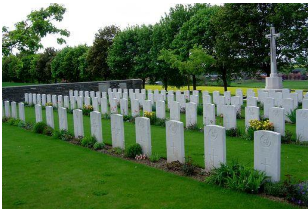
Heninel Communal Cemetery Extension