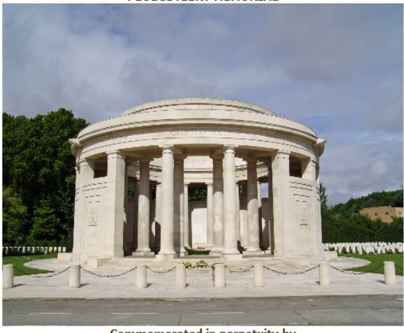
Commemorated in perpetuity by the Commonwealth War Graves Commission

Remembered with honour PLOEGSTEERT MEMORIAL