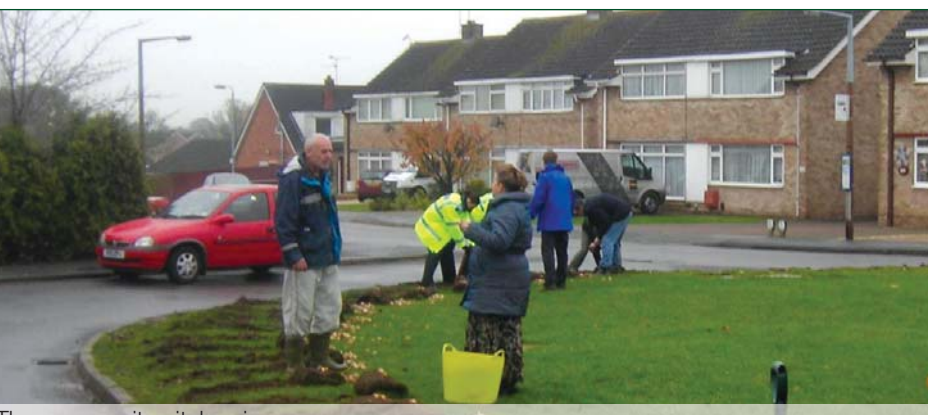
The community pitches in