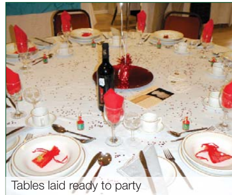
Tables laid ready to party

cannot find what you are looking for then I'm sure we can work to accommodate your every need.