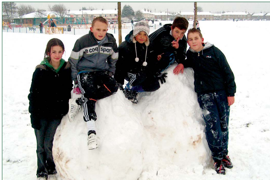
Snow school today - Children enjoying the unexpected day off school

The Leisure Centre Committee is keen to gauge local interest in using the alley, especially on Sunday evenings. So if you would like to know more and discuss organising a skittles evening, why not give the Leisure Centre a call on 01793 825525.