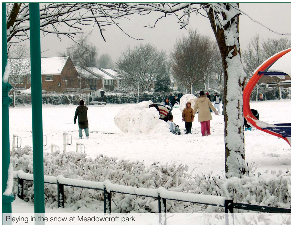
Playing in the snow at Meadowcroft park

The Council has a turnover of approximately £1.4 million per annum and that money is used to provide a range of services including the Stratton Community Leisure Centre, the Meadowcroft Community Centre, 12 open spaces which include play areas in 8 locations, Council Offices at the