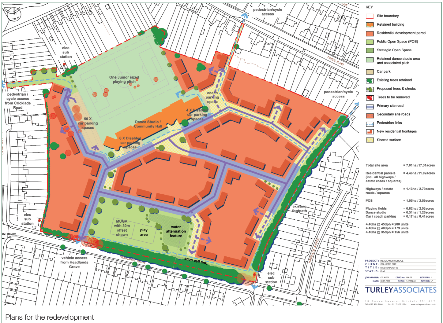
Plans for the redevelopment

The Parish Council objections regarding the Former Headlands School site include: