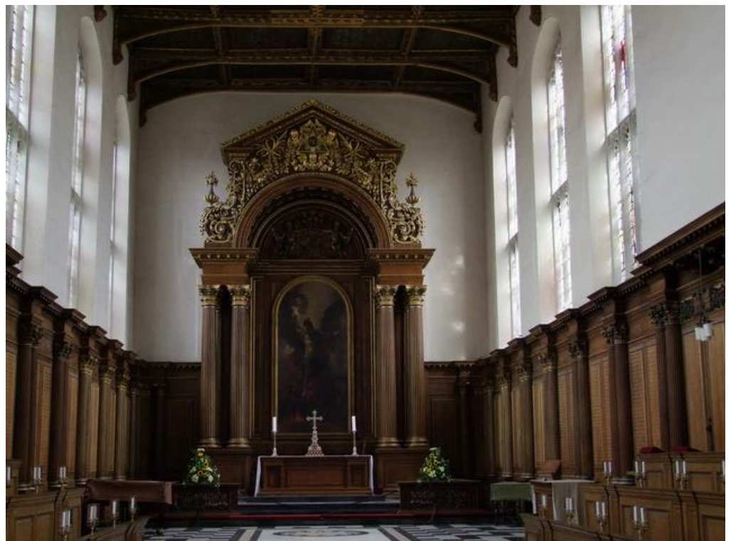
Trinity College Chapel – War Memorial

Osmond Bartle Wordsworth is remembered in the Trinity College Chapel – War Memorial located on Chapel south wall.