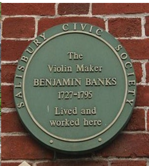
The plaque in Catherine Street