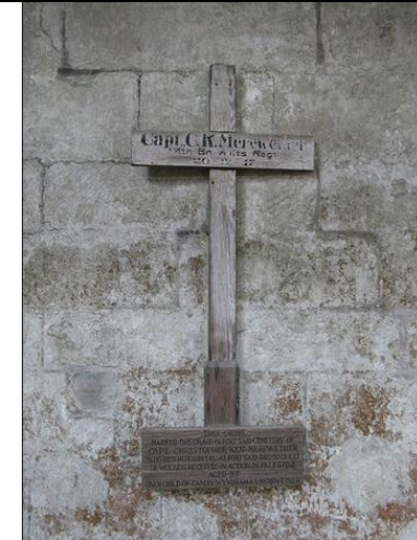
Named on the Winchester College War Cloister, Winchester, Hampshire (Outer 6)