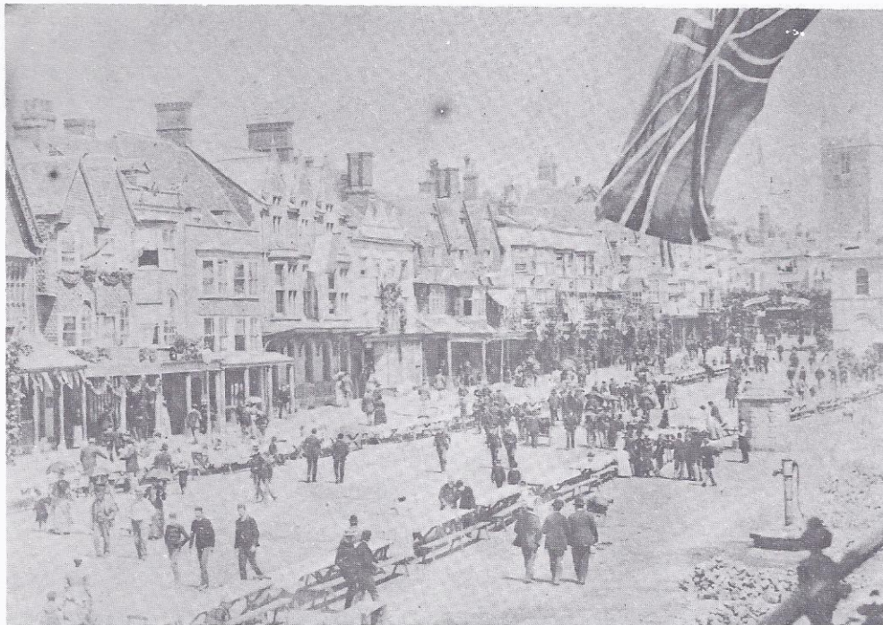
QUEEN VICTORIA'S GOLDEN JUBILEE CELEBRATIONS IN MARLBOROUGH IN 1887