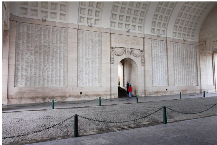
WWI Names panel on Atworth War Memorial