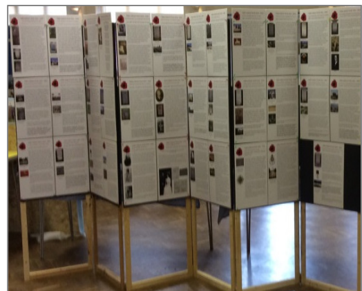
Biopics of The Great War casualties