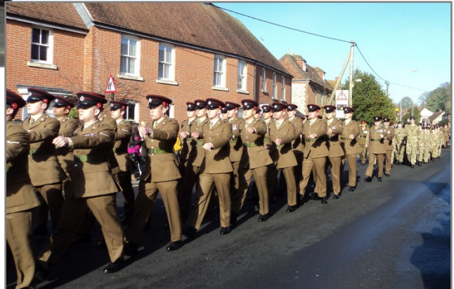
A foggy start in Ludgershall but the sun eventually shone on the Armistice Day Parade