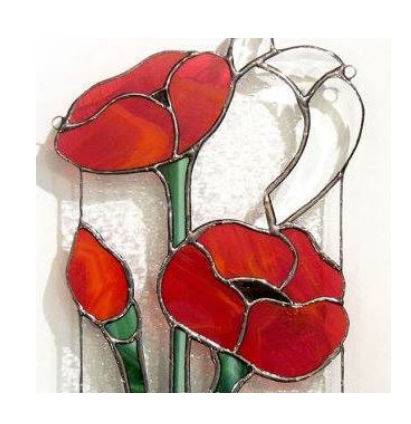
Casualty of WWI