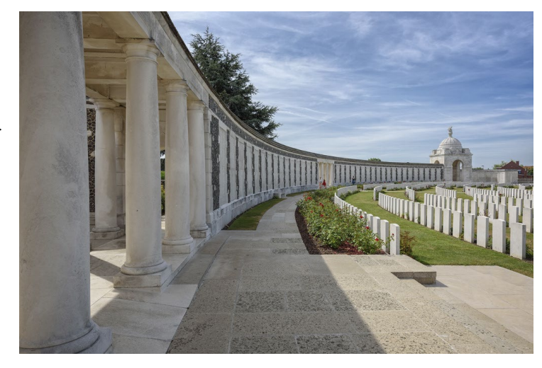
Tyne Cot Memorial, Zonnebeke, West-Vlaanderen, Belgium ightarrow