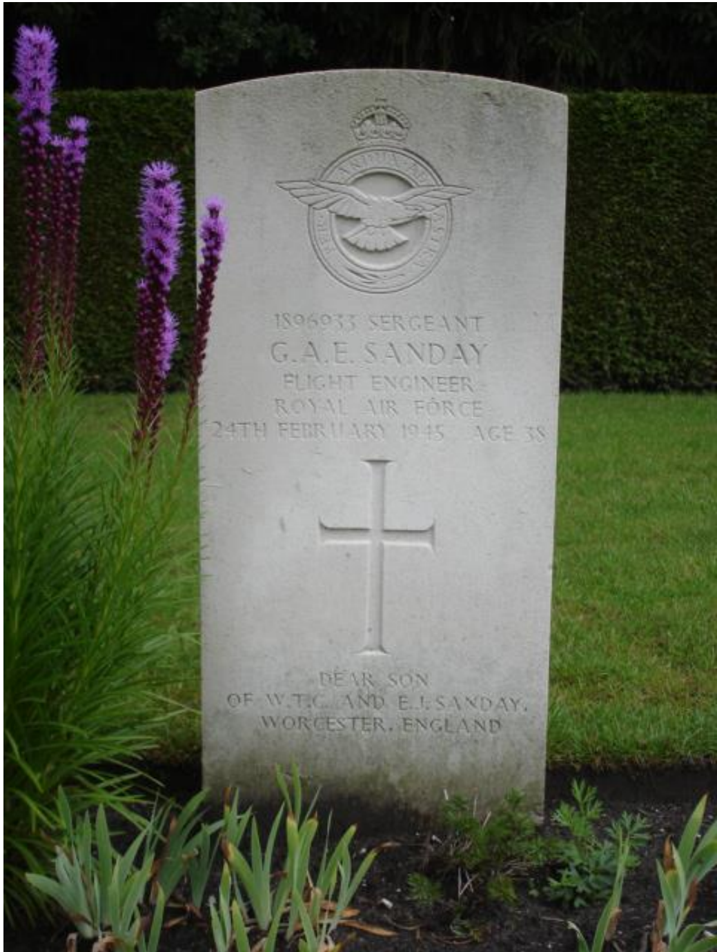
Photo of Sergeant G. A. E. Sanday's CWGC headstone located at Venray War Cemetery, Limburg, Netherlands.