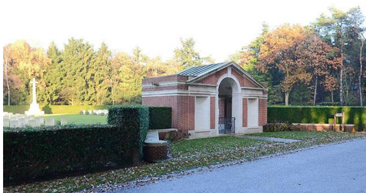
Venray War Cemetery

Venray War Cemetery contains 692 Commonwealth burials of the Second World War, 30 of them unidentified, and one Polish burial.