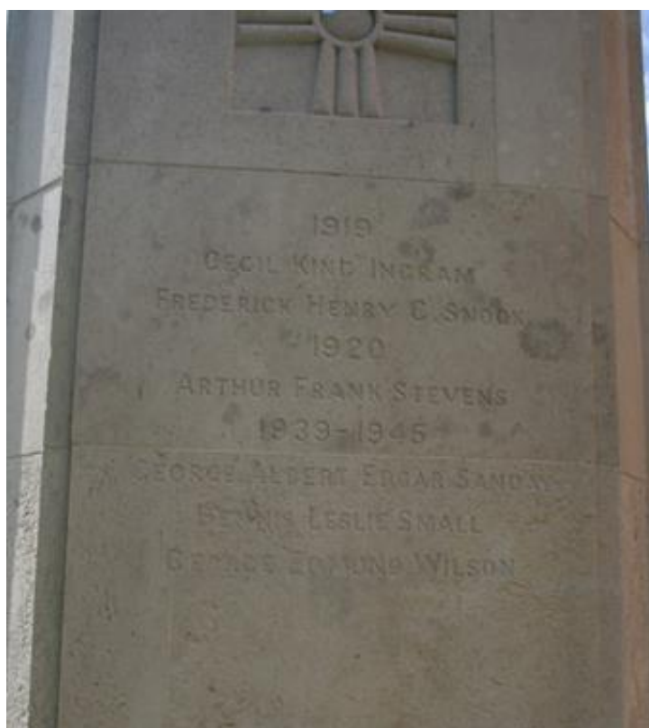
Hindon War Memorial