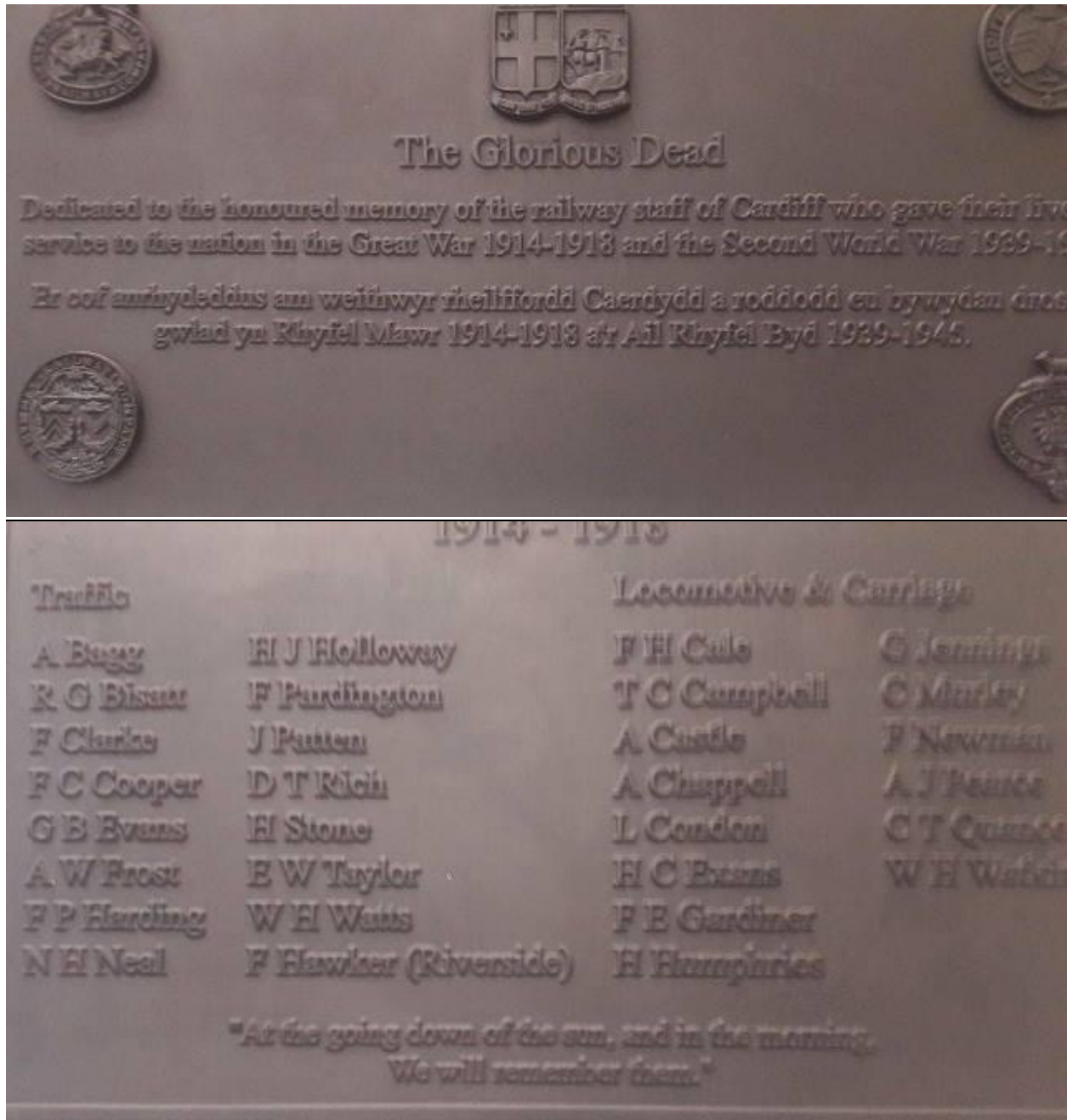
GWR Memorial Plaque, Cardiff Central Station