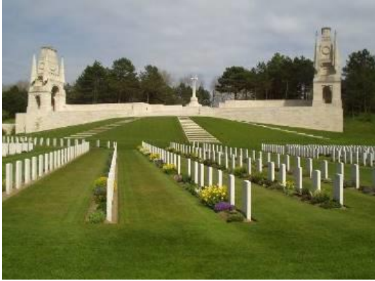
Etaples Military Cemetery, France