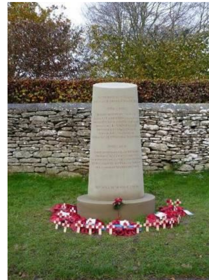
South Wraxall War Memorial