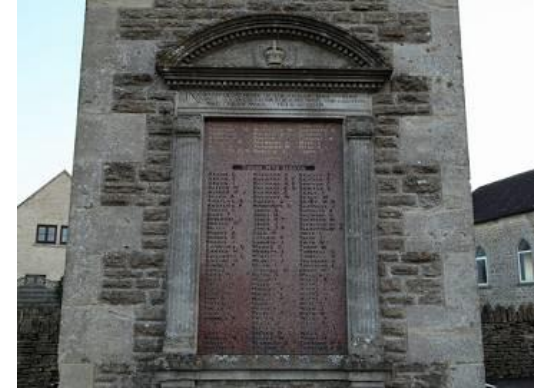
Atworth Clock Tower Memorial