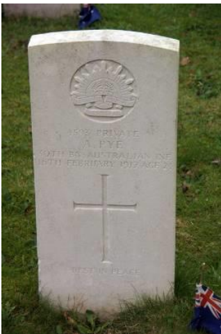
Photo of Pte. A. Pye's CWGC Headstone at St. Edith's Churchyard, Baverstock, Wiltshire. (Photo courtesy of Andrew Stacey 2012)