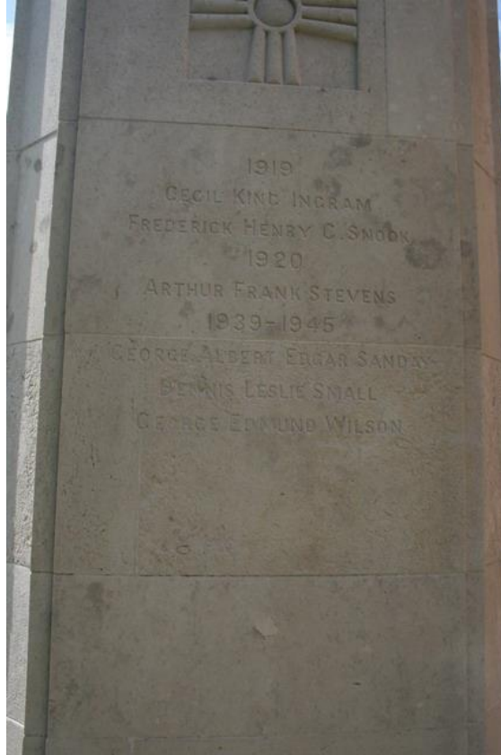
← Hindon War Memorial