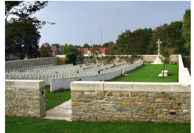
Doullens Communal Cemetery Extension No.2, Somme, France