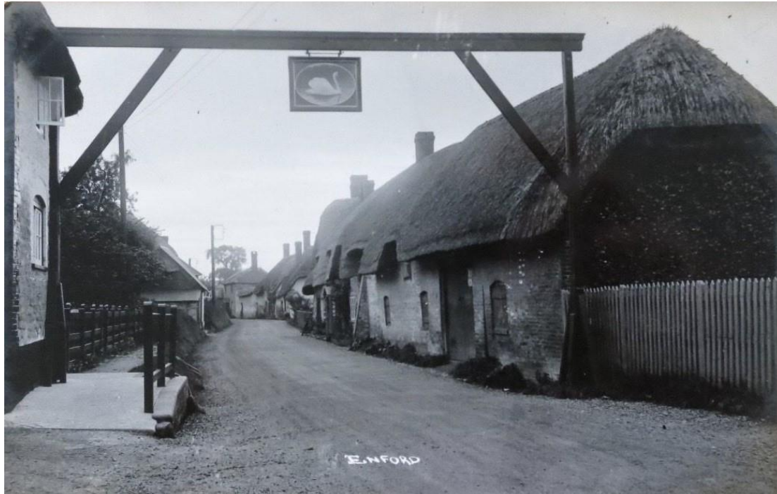
The Swan at Enford