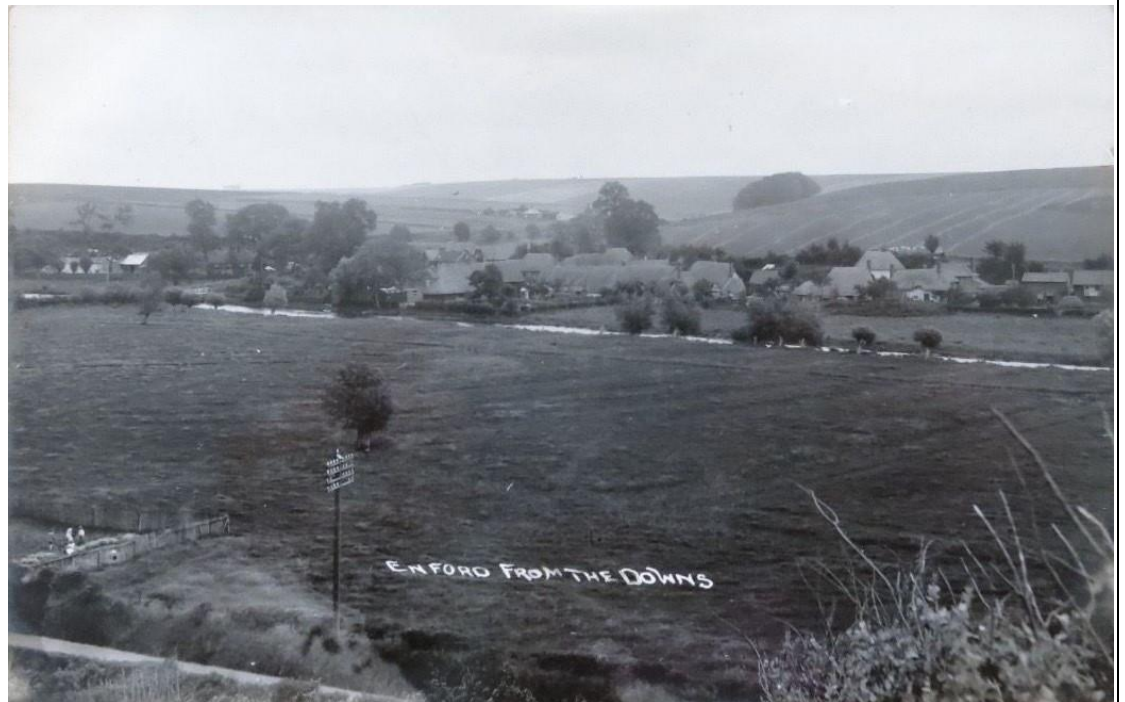
View of Enford from the Downs.