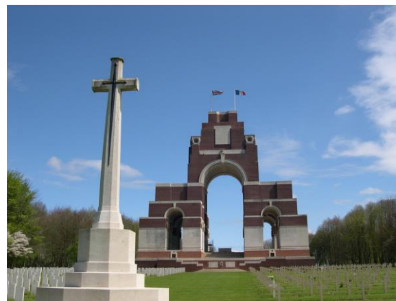
Left = Donhead St. Andrew War Memorial