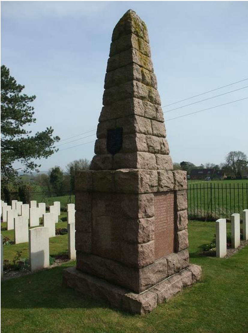
Memorial to 1 st Training Battalion A.I.F. at Durrington Cemetery