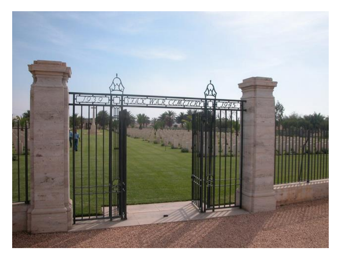
Sfax War Cemetery (Photo & information from CWGC)

The single First World War grave in Sfax War Cemetery was brought in from Bizerta Sidi Saleru Moslem Cemetery in March 1983. There is also 1 Greek soldier of the 1939-45 war buried here.