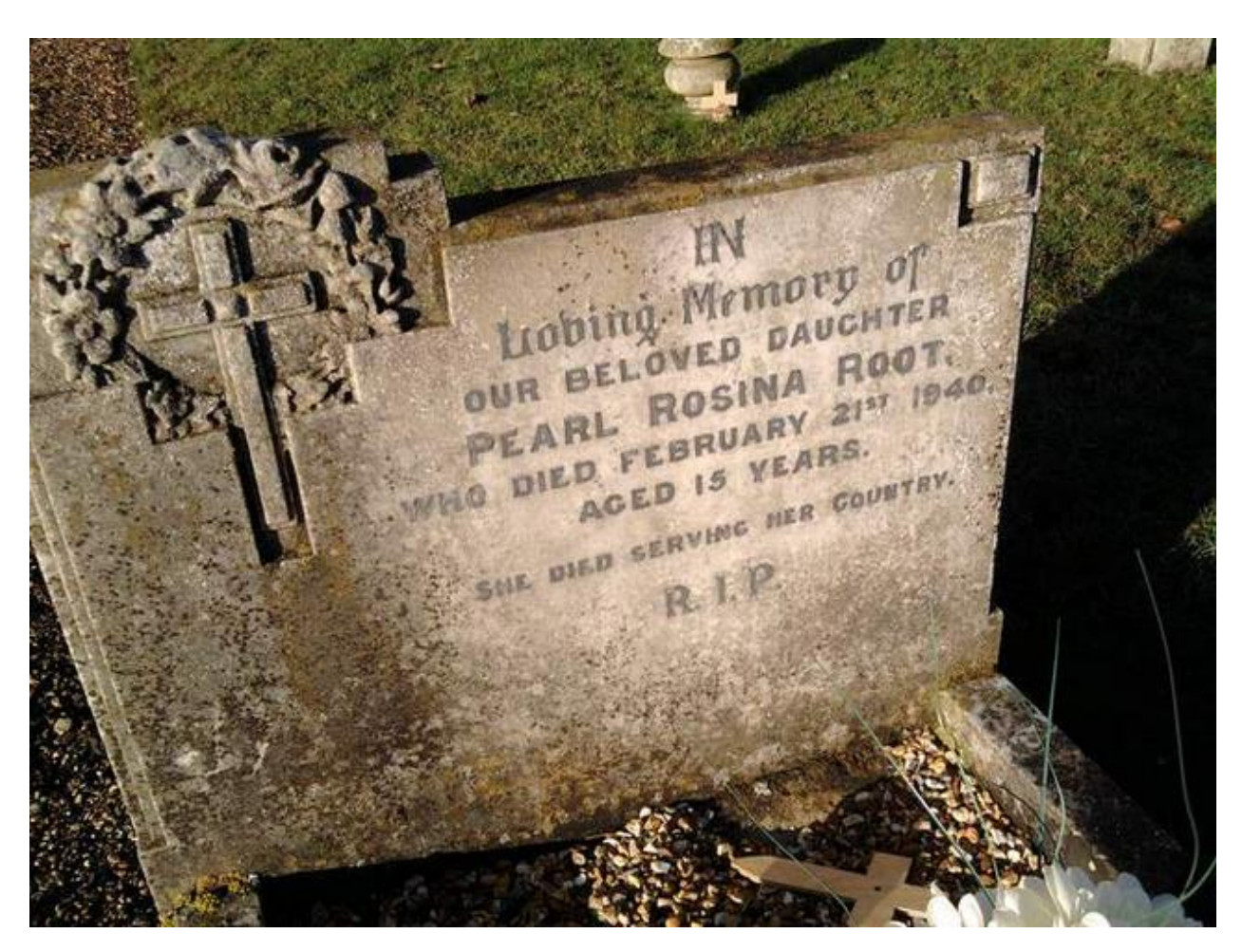
Headstone of Pearl Rosina Root

Pearl Rosina Root was buried in Durrington Cemetery, Wiltshire on 26th February, 1940 in Plot 1101.