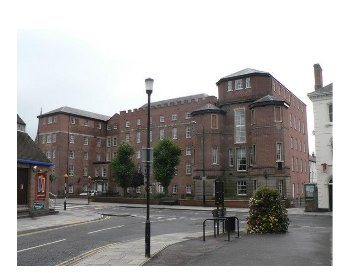
Salisbury – The Old Infirmary now residential