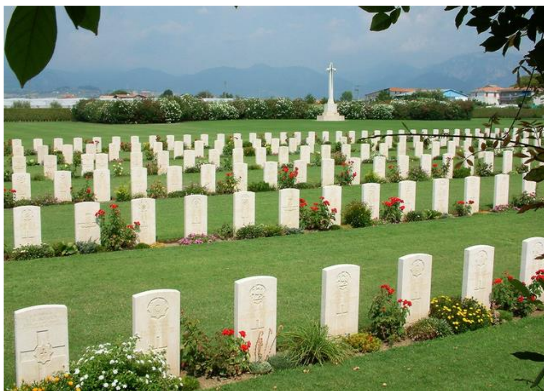
Salerno War Cemetery (Photos & information from CWGC)

Salerno War Cemetery contains 1,846 Commonwealth burials of the Second World War, 107 of them unidentified. One casualty of the First World War is also commemorated in the cemetery by special memorial, his grave in a local civil cemetery having been lost.