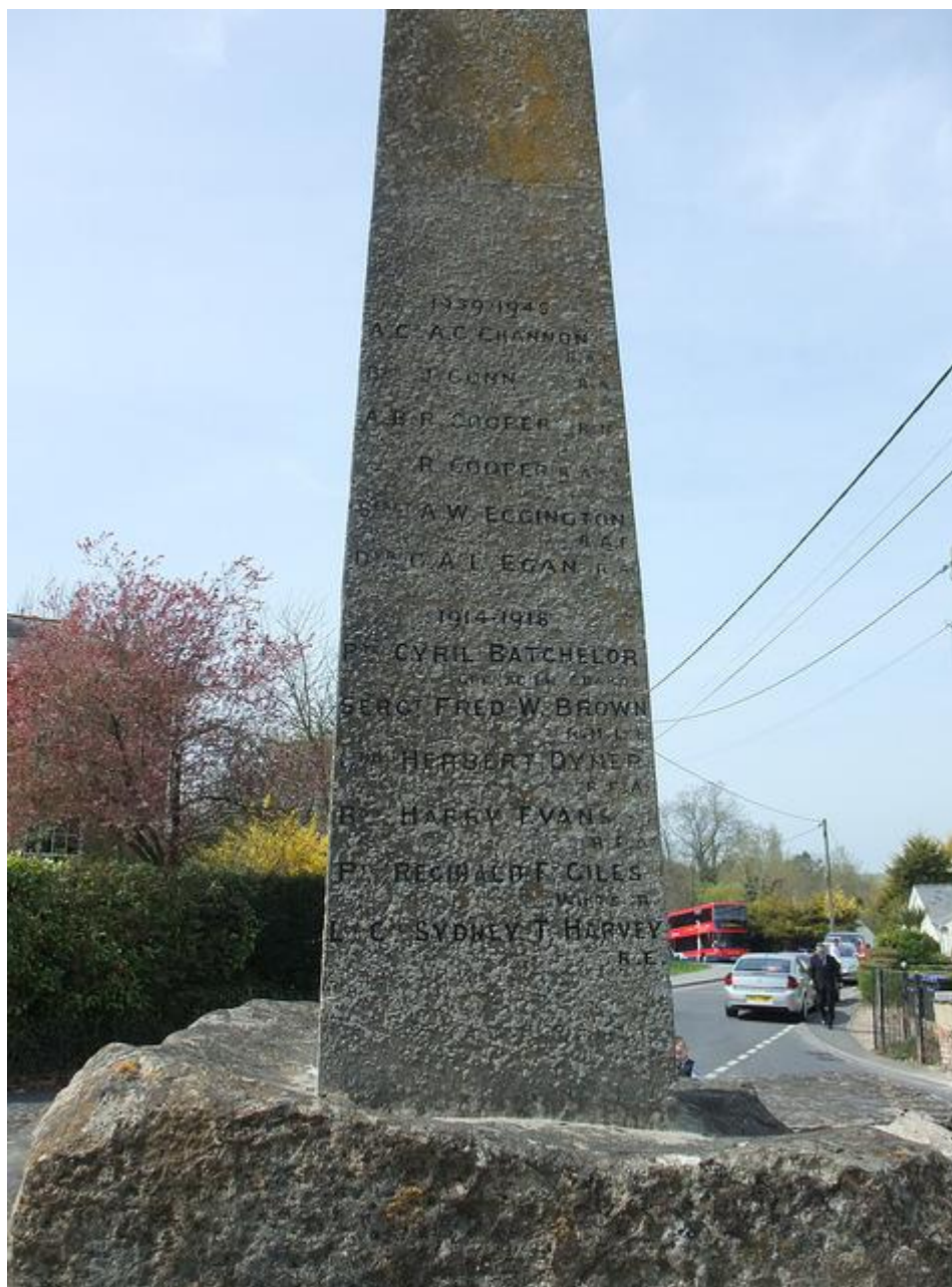
Durrington War Memorial