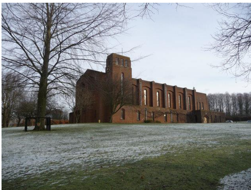
Durrington - Larkhill - St. Alban The Martyr (Garrison Church of Larkhill Camp)