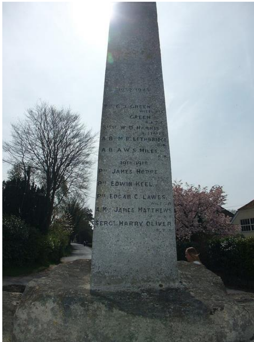
Durrington War Memorial