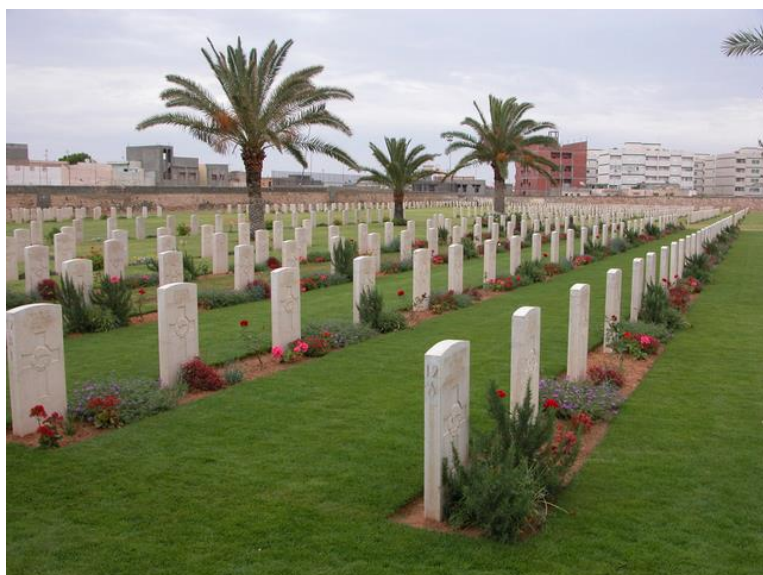
Tripoli War Cemetery ( Photos & information from CWGC )

Tripoli War Cemetery contains 1,369 Commonwealth burials of the Second World War, 133 of them unidentified. There are 19 non Commonwealth burials and 7 non world war service burials here.