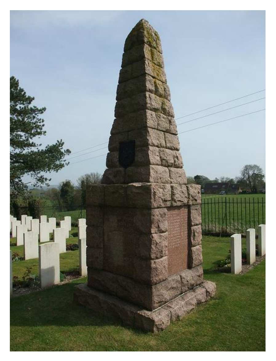
Memorial to 1<sup>st</sup> Training Battalion A.I.F. at Durrington Cemetery