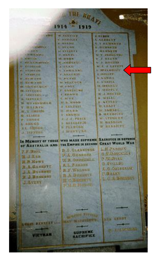
Beechworth Shire Honour Roll WW1

P. <u>McElhenny</u> is also remembered on the Beechworth Shire Honour Roll located at Ford St, Beechworth, Victoria. (3rd Column, 10th name)