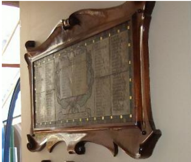
Launceston Pilgrim Uniting Civic Centre Honour Roll