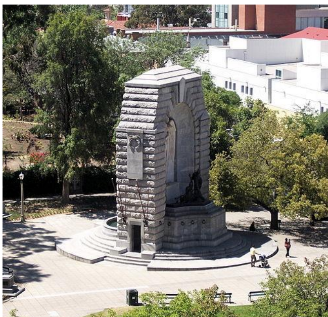
Adelaide War Memorial