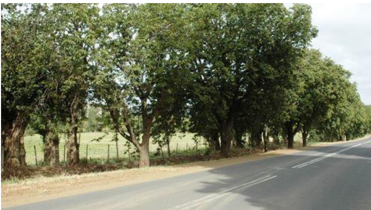
Bushy Park – Memorial Avenue