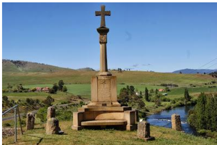
Gretna War Memorial