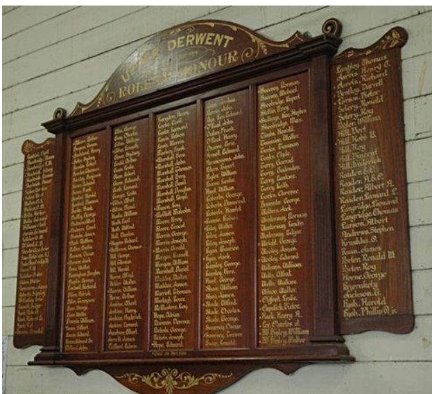
Upper Derwent Roll of Honour – Bushy Park Hall

Pte Edney Shadwick was also remembered on the Upper Derwent Roll of Honour located at Bushy Park Hall, Gordon River Road, Bushy Park, Tasmania.