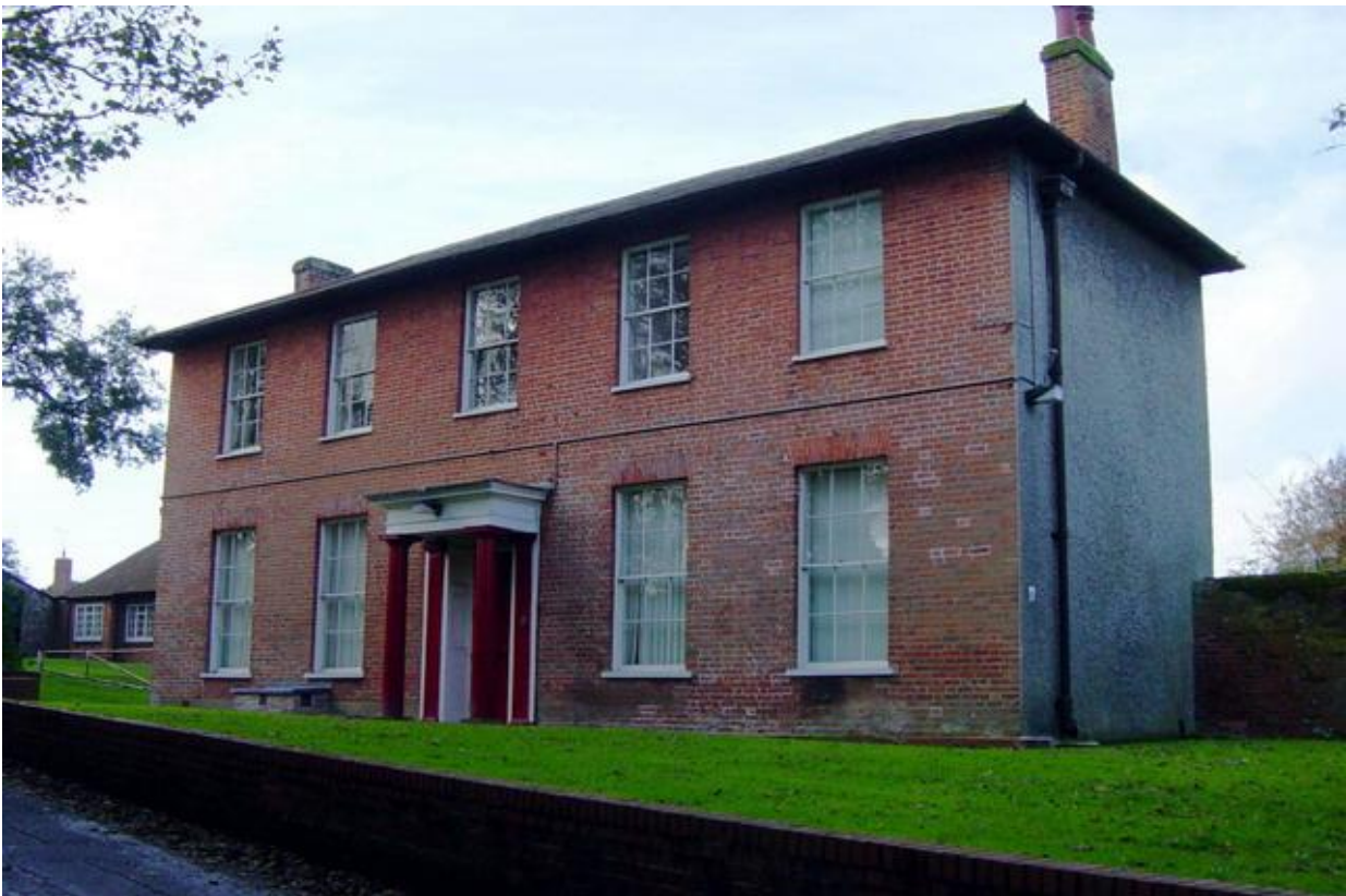
Durrington - Red House

(Information from 1965 - W.I. & retrieved courtesy of Dave Healing)