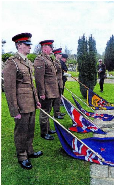
British, Australian and New Zealand flags and the Shrewton RBL Standard are lowered