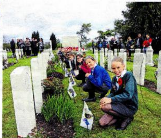
Children from nearby schools lay flags on the soldiers' graves