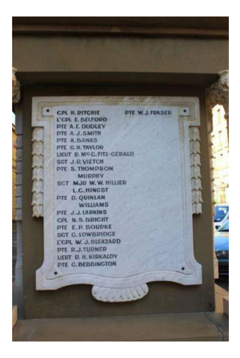
Newcastle Word War 1 Memorial