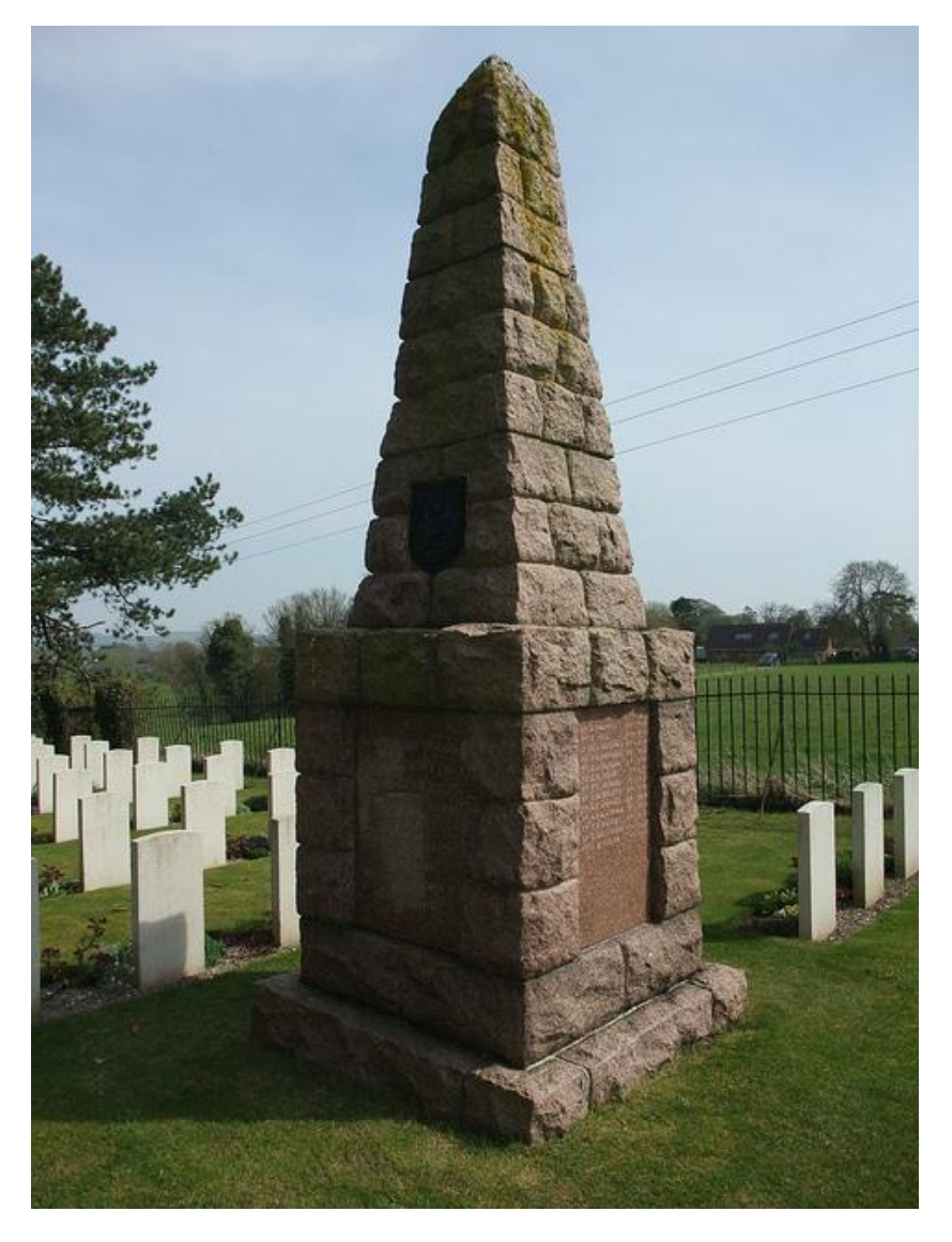
Memorial to 1<sup>st</sup> Training Battalion A.I.F. at Durrington Cemetery