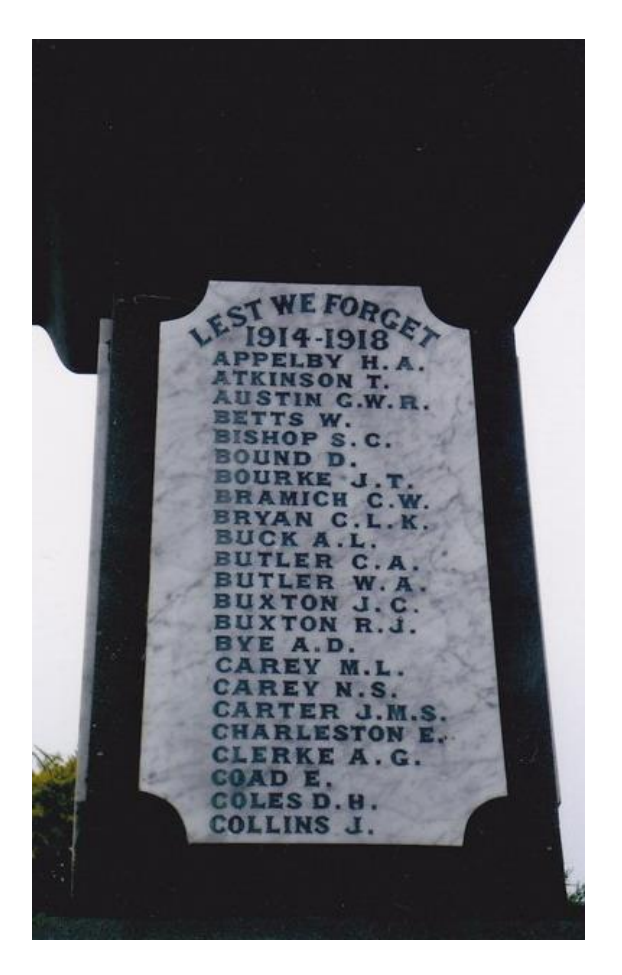
Sheffield War Memorial