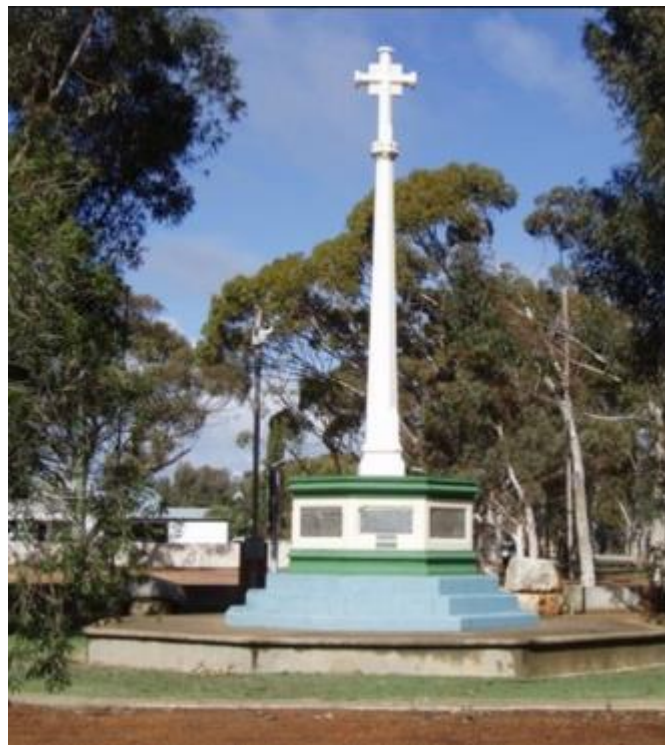
Moora War Memorial