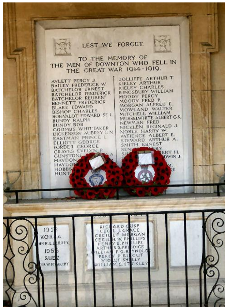
Downton War Memorial