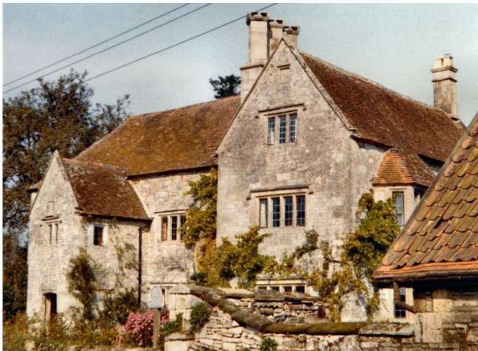
Little Clarendon