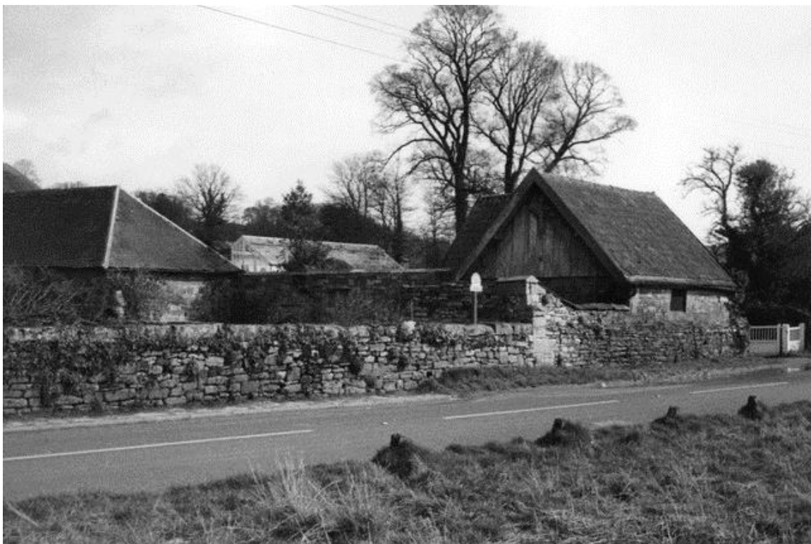
Roman Catholic Chapel adjoining Little Clarendon