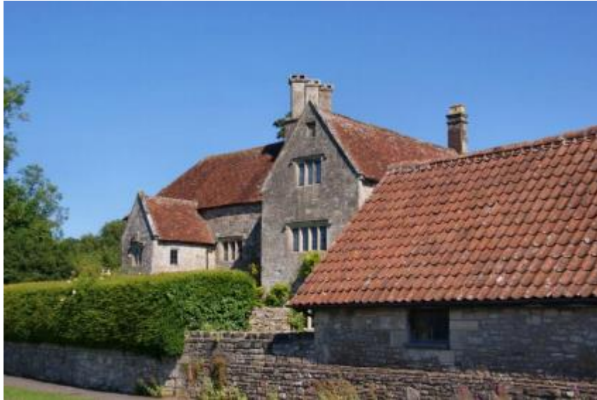
Little Clarendon