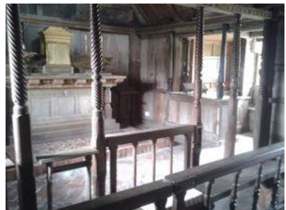
Catholic Chapel at Little Clarendon