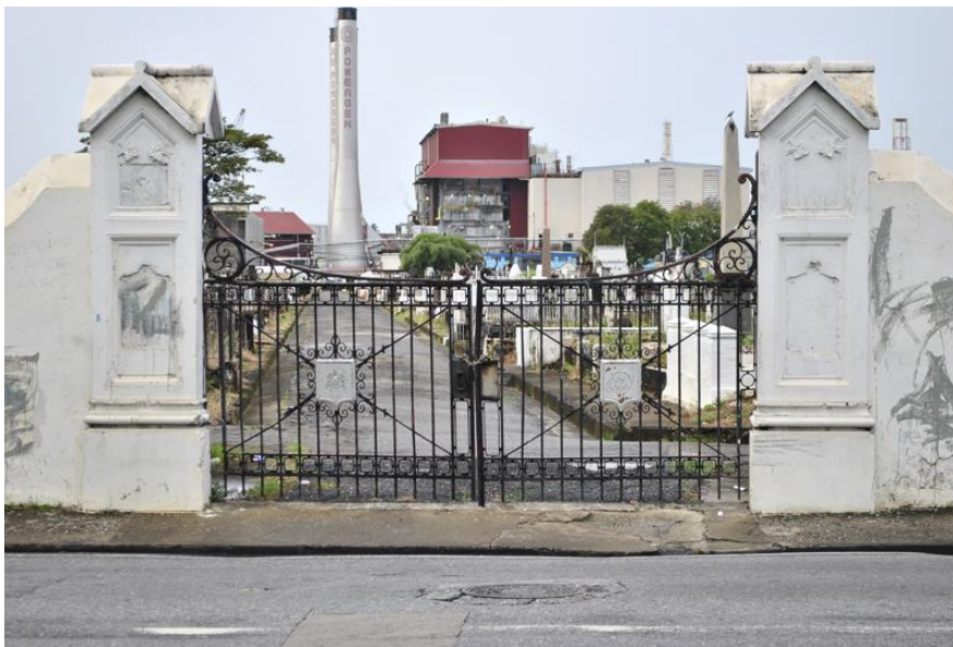
Lapeyrouse Cemetery, Tragarete Rd, Port of Spain, Trinidad 2012.