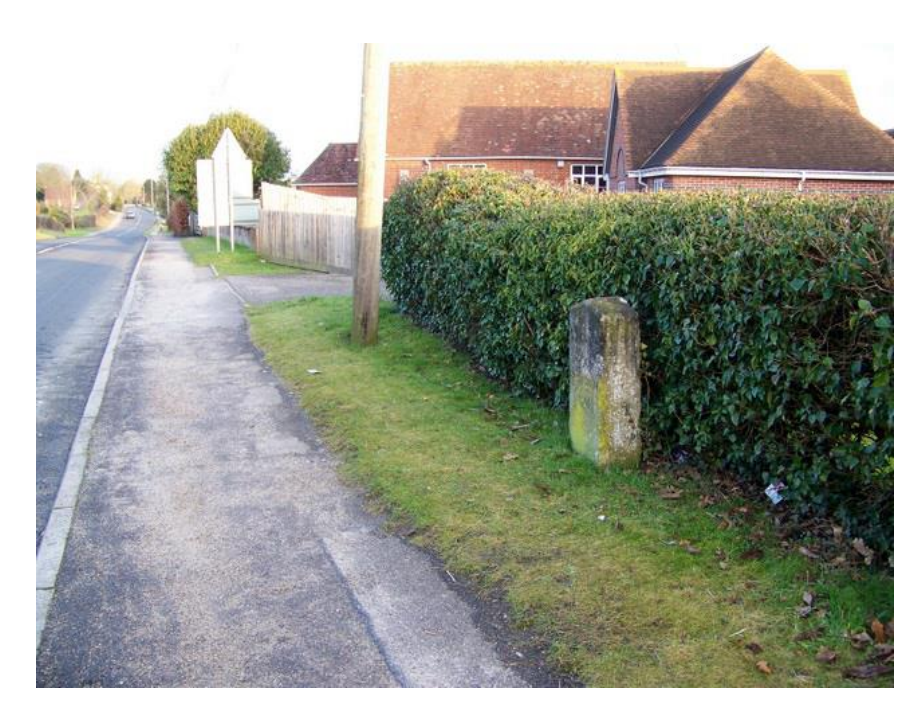
Dinton - Listed Milestone - 50 mtrs west of Dinton First School