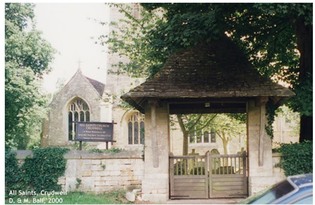
Lychgate at All Saints Church, Crudwell