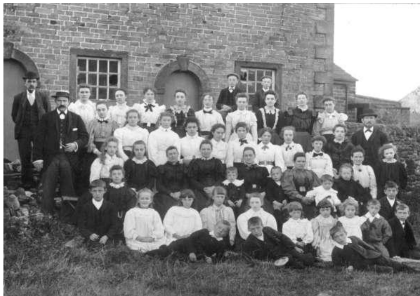
Cowling Hill Baptist Chapel – September, 1900.