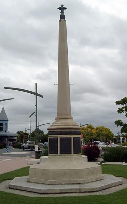
Havelock North War Memorial