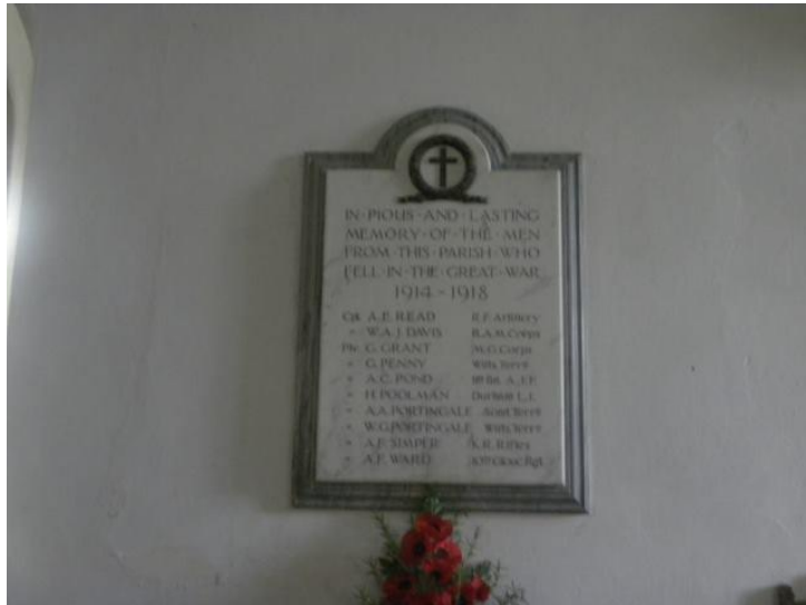
← St. Mary Church Memorial, Codford St. Mary